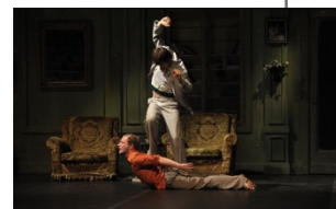
Le Salon (2004)