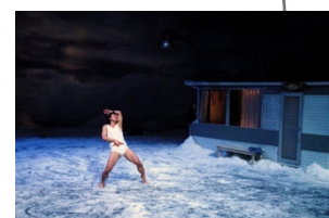
32, rue Vandenbranden (2009)