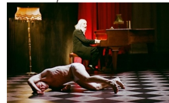
A Louer (2011)