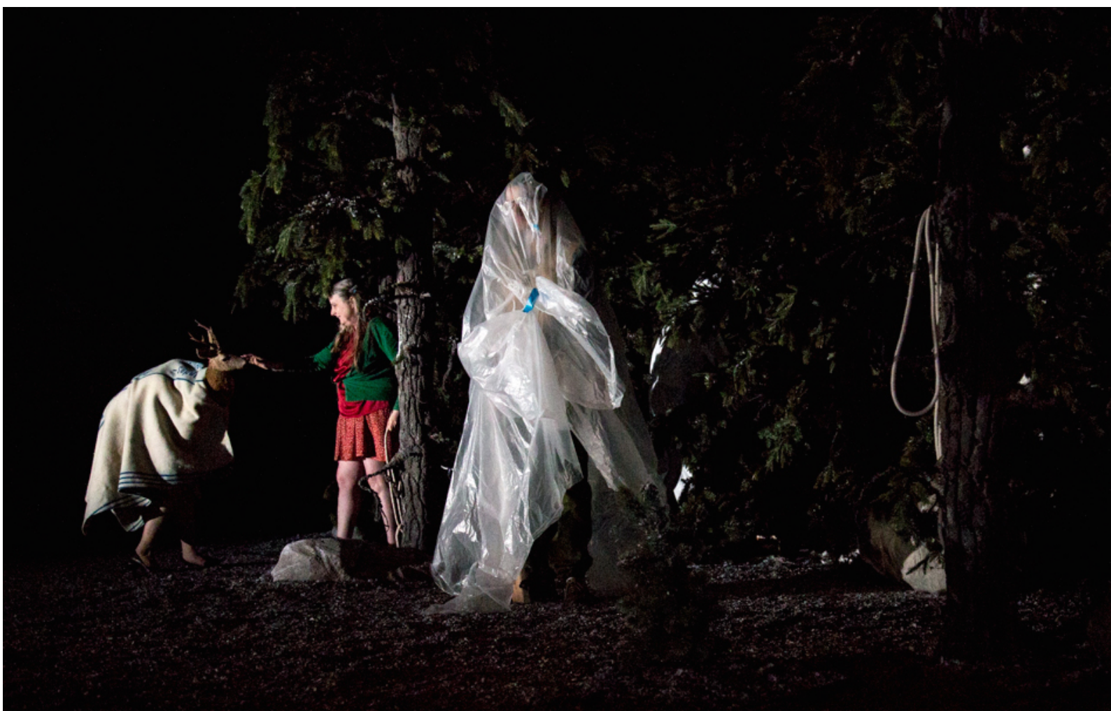
Kind, © Oleg Degtiarov, Peeping Tom