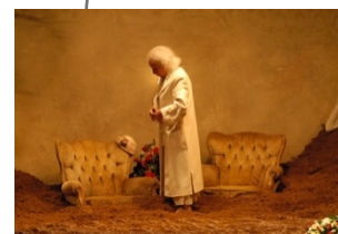
Le Sous Sol (2007)