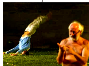
Le Jardin (2002)

Using film editing techniques, they manage to extend the limits of the plot, which always comes across more as a contour than as something you can pin down with any certainty. The 'huis clos' of family situations remains for Peeping Tom a major source of creativity. The company is currently producing a second trilogy – Vader , Moeder , Kind – around this theme.