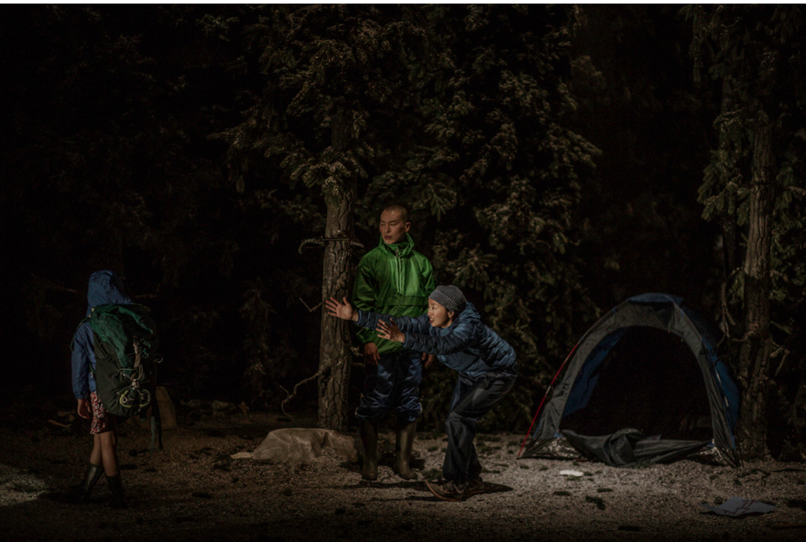
Kind, © Virginia Rota, Peeping Tom