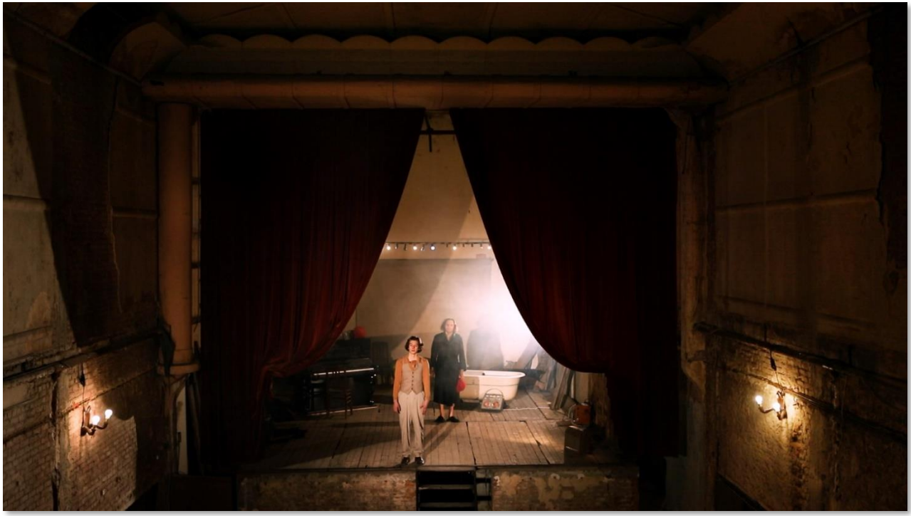
You can view the trailer for 'Sono io?' on YouTube via this link: <a href="https://youtu.be/cRsVEoVk-Ko">https://youtu.be/cRsVEoVk-Ko</a>