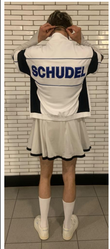
+TRAINING JACKET 'SCHUDEL'