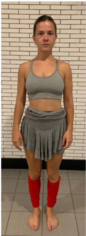
layer 1: grey BH