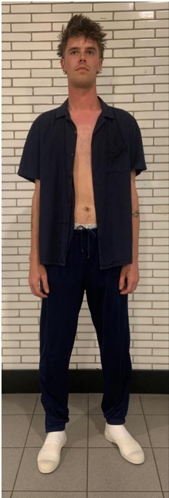
FIRST LAYER: blue linen shirt